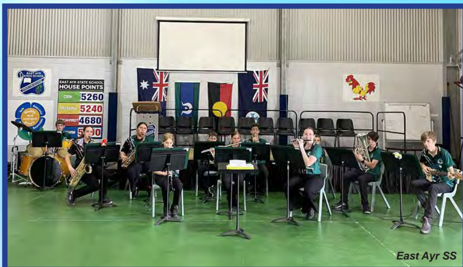
East Ayr SS

The band were a hit at each school with many requests that they return in the future.